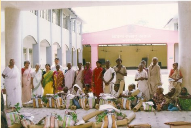
Above: Kalpataru Project at Sarada Kalyan Bhandar (SKB) Deenabandhu sponsors higher education, child welfare projects & Kalpataru project at SKB ,Midnapore, WB www.skbcharity.com