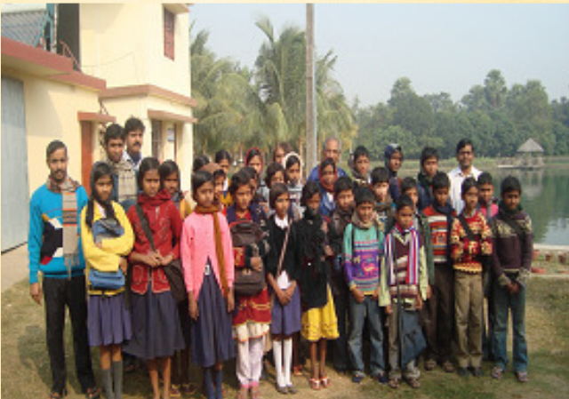
Children enrolled under Swami Vivekananda Academic Excellence Tutorial Program (Class V to X) at Gohaldanga (sponsored by Deenabandhu) www.rsvsevakra.org